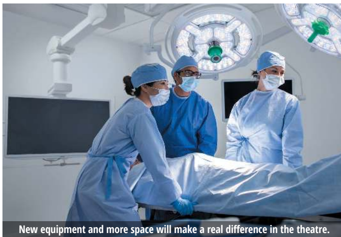
New equipment and more space will make a real difference in the theatre.

Right now, Sydney Eye Hospital Foundation is raising funds to give an operating theatre a makeover that will take much of the equipment off the floor and suspend it from the ceiling.